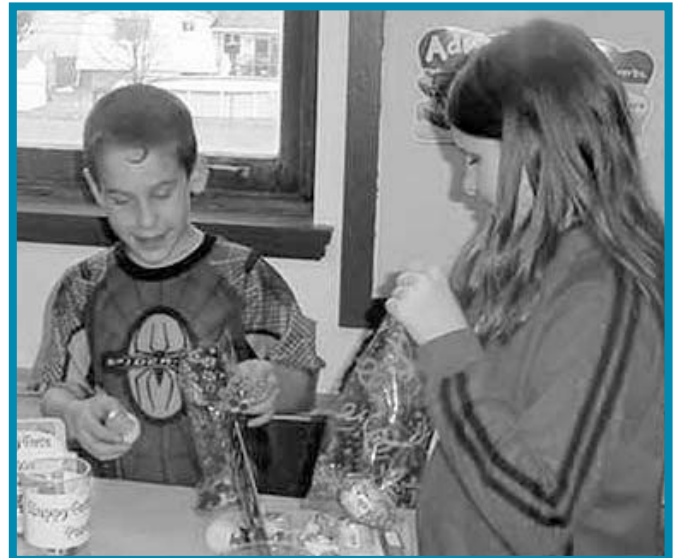
The Dyna-Loot creators won local recognition from the Riverside School Board in the 2005 Québec Entrepreneurship Contest.

to explain how they could contribute to specific committees. They brainstormed to come up with their Dyna-Loot logo and “explosion of fun” slogan. They worked as a team to put together the loot bags and market them to the rest of the school. Finally, they used their math to keep track of finances.