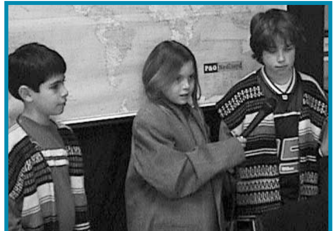
Weather was big news for these young students, who drew on their math, science, ICT and language skills for some real-life learning.

Through the “Weather Whys” unit, students learned basic skills in a realistic context that connected learning with everyday life and the world of work. I am certain that the students will remember the information they researched themselves far longer than they would have had it simply been presented to them in a textbook or classroom lecture.